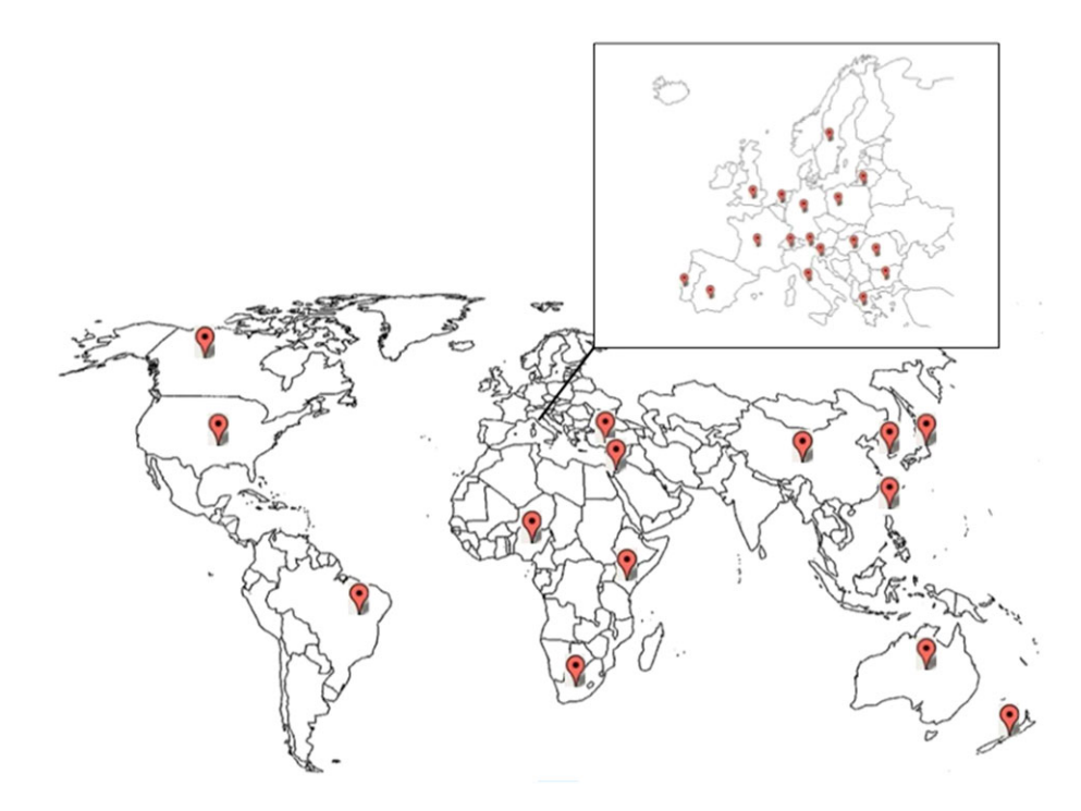
FIGURE 1 Psycho-oncology societies, currently (2015) members of the International Psycho-oncology Society (IPOS) Federation, by areas of the world: Africa: Psycho-oncology Society of Nigeria (POSON); North America: American Psychosocial Oncology Society (APOS), Canadian Association of Psychosocial Oncology (CAPO). South America: Brazilian Psycho-oncology Society (SBPO). Europe: Austrian Platform of Psychooncology (ÖPPO), British Psychosocial Oncology Society (BPOS), Bulgarian Society of Psycho-oncology (BAPO)*, Dutch Society of Psychosocial Oncology (NVPO), French Society of Psycho-oncology (SFPO), German Association of Psycho-social Oncology (DAPO), Hellenic Society of Psychosocial Oncology (HSPO, Greece), Hungarian Psycho-oncology Society (MPOT); Italian Society of Psycho-oncology (SIPO), Lithuania Association of Psychosocial Oncology (POA, Lithuania), Polish Psycho-oncology Society (PPOS), Portuguese Academy of Psycho-oncology (APPO), Portuguese Psycho-oncology Society (SPPO), Romanian Association of Psycho-oncology (ARPO), Slovenian Society of Psycho-oncology; Spanish Psycho-oncology Society (SEPO), Swedish Psycho-oncology Society (SWEDPOS), Swiss Society of Psycho-oncology (SGPO). East Asia: Chinese Psycho-oncology Society (CPOS), Japan Psycho-oncology Society (JPOS), Korean Society Psycho-oncology, Taiwanese Psycho-oncology Society (TPOS). Australia/New Zealand: Australian Psychosocial Oncology Society (OZPOS) and Psycho-oncology Co-operative Research Group (PoCoG, Australia), Psycho-social Oncology New Zealand (PONZ). Middle East: Israel Psycho-oncology Society (IPSO); Turkish Psychosocial Oncology Association (PSOD). *The Bulgarian Society of Psycho-oncology became part of the Federation in 2015. There are also countries that have societies in a developing phase, including the Irish Society of Psycho-oncology, the Russian Society of Psycho-oncology, the Psychooncology Society in Kenya and the Society of Psycho-oncology in South Africa, where, at the moment, the South African Oncology Social Work Association (SAOSWA)

emerge in this study. Because the main aim of the questionnaire was to assess the profile of each society, the criteria for the developmental level of palliative care service from the Global Atlas of Palliative Care<sup>20</sup> were adopted by replacing the word palliative care by PSOC. The major areas covered by the questionnaire are reported in Appendix A, in which 6 levels of psychosocial care organization is indicated, as reached on a consensus basis within the aforementioned FPOS meeting. The president (or a designated member) of each POS was then officially approached and the questionnaire emailed in January 2014.